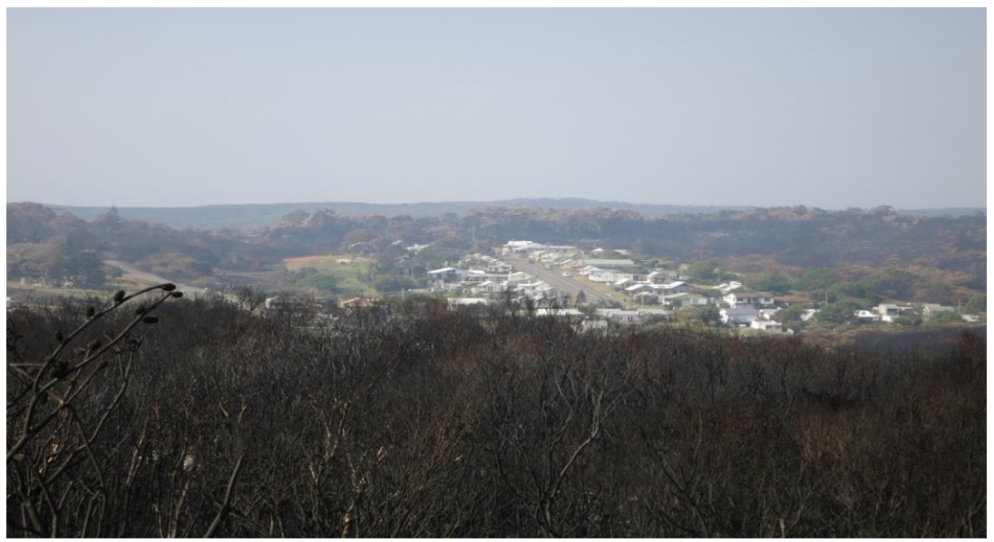
The Bay – Looking South

Also, a big thanks to the Police and other Emergency Services who helped support the people of the Bay throughout this ordeal.