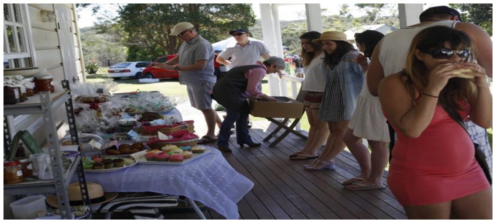
The World's Best Cakes Stall