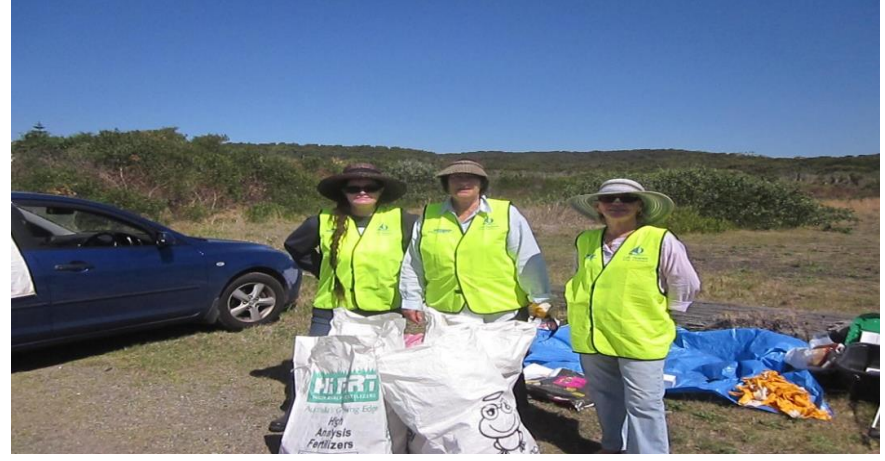
Clean Up Day Volunteers

After the fire, it was terrible to see the amount of dumped rubbish. How to address the clean-up of this rubbish is a community issue requiring a community answer. Suggestions are welcome as there is an enormous amount of work to be done, 1000s of bottles – see photos that follow!!