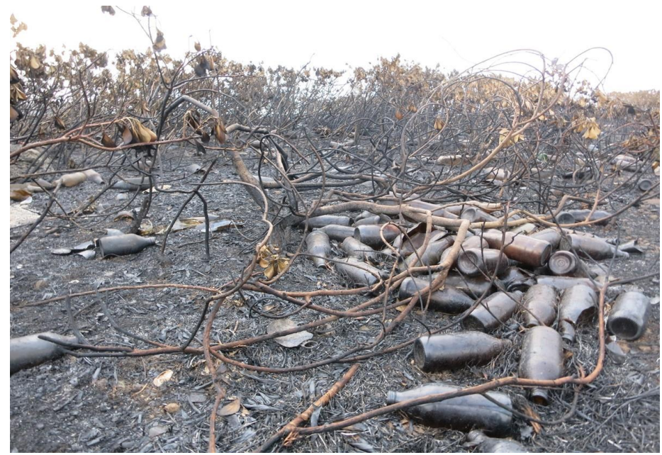
Headland south of Jetty