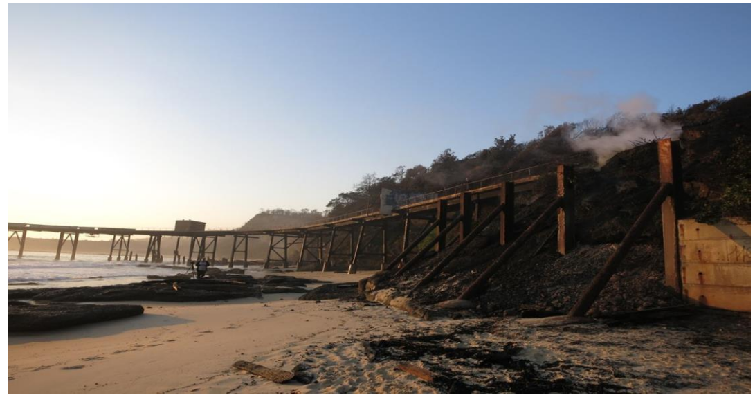
The Jetty – Looking South