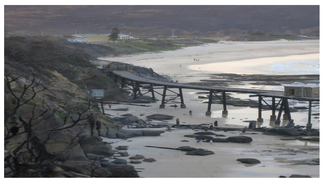
The Jetty – Looking North