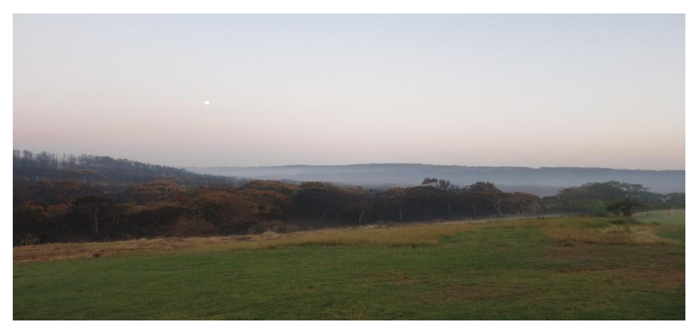
Land cleared / fire break by Residents – western side of Clarke Street

Land recently cleared by Residents and LakeCoal – eastern side of Clarke Street