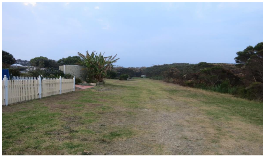
Land cleared / fire break by Residents - southern side of Lindsley Street