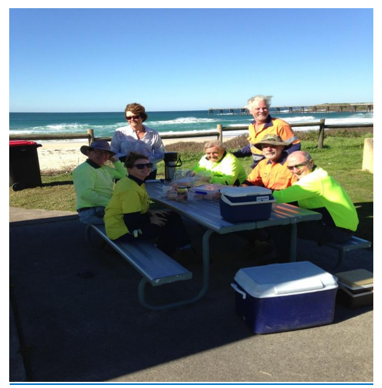
LMCC and Landcare Volunteers

• For more Landcare information, please contact Carmel, Ph: 0438499636.