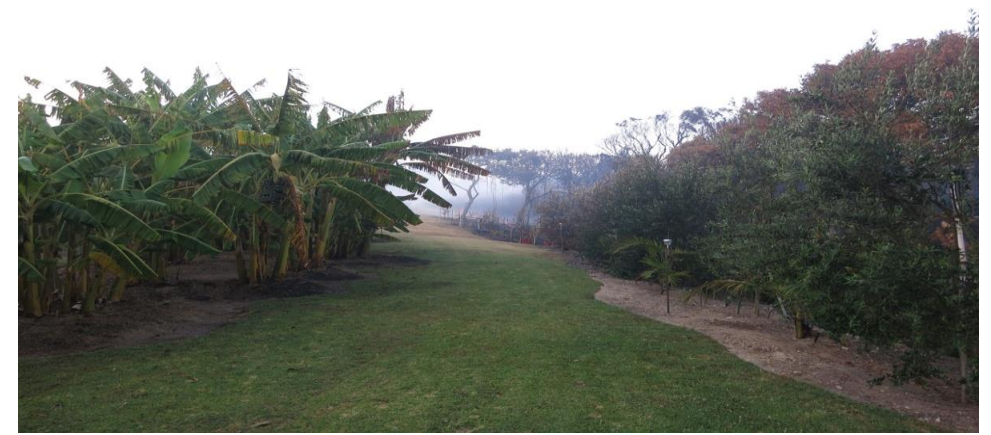
Land cleared / fire break by Residents – western side of Clarke Street