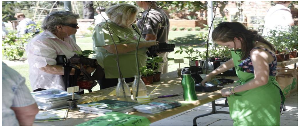
The Garden Seedling Stall