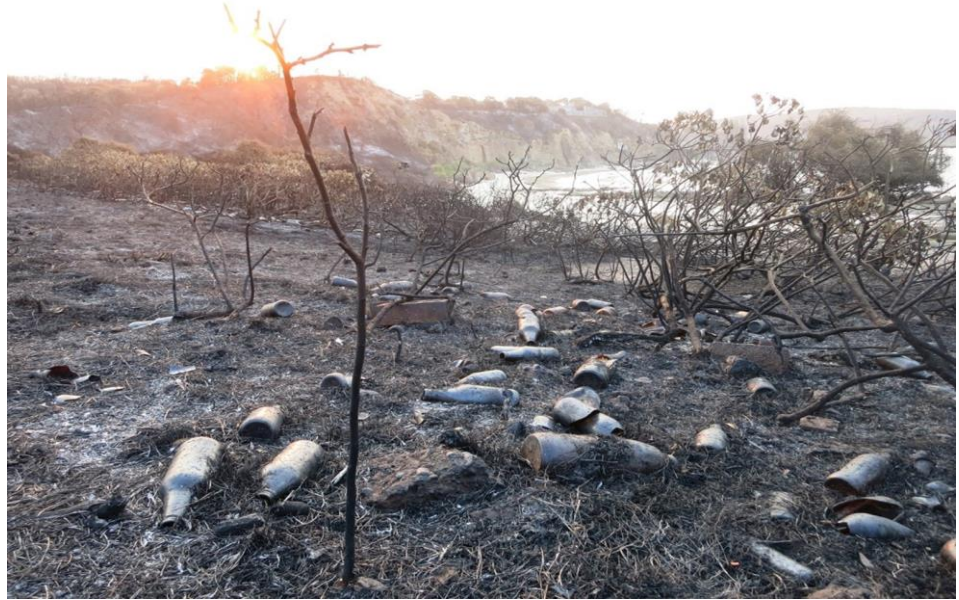
Headland South of Jetty

In the meantime, please be mindful of where you are walking (watch your step) and the environment, and when walking take a garbage bag with you as every little bit of rubbish picked up, counts!