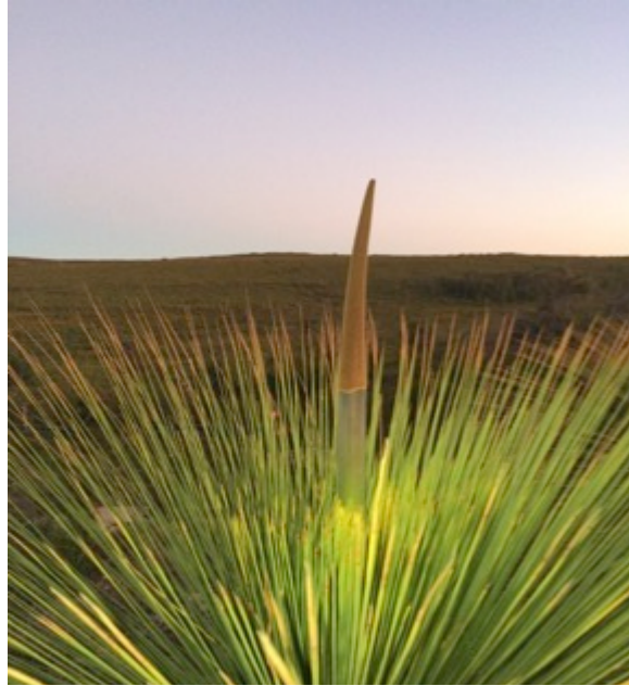
Grass Tree (Xanthorrhoea) (*)