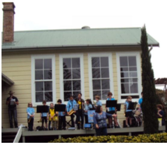
Nords Wharf PS band