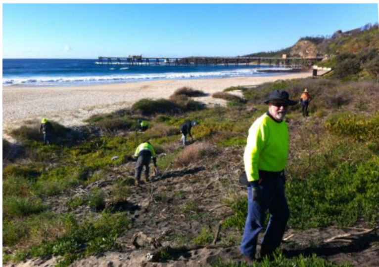
Lake Mac Landcare Green Team at work in Catho in 2014

www.catherinehillbay.org.au/services/landcare/Catherine%20Hill%20Bay%202021%20Landcare%20Agreed%20Action%20Plan.DOC