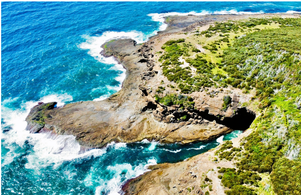
Aerial shot of the Pink Cave including the rock shelf access via Moonee Beach