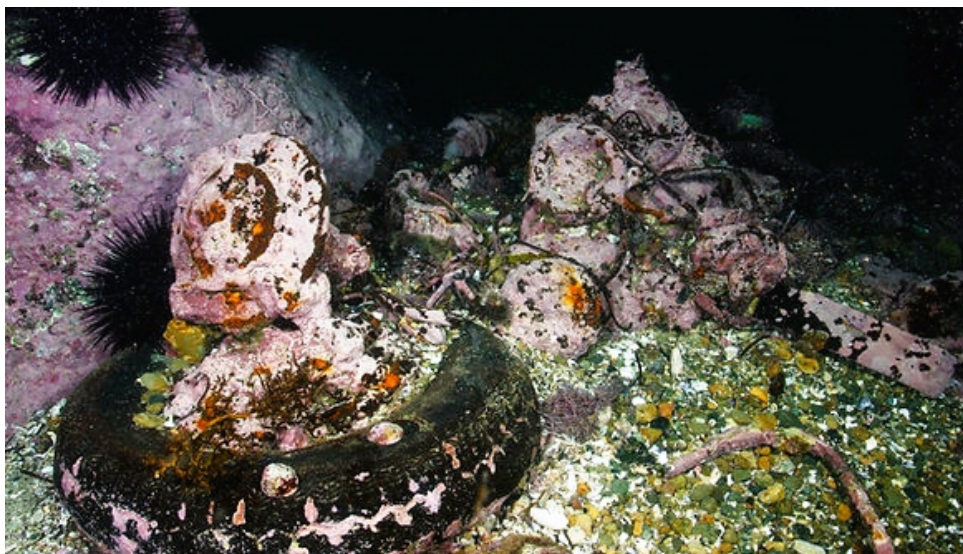
Remains of the car on the sea floor today

Going by a more recent picture (see below), this is no longer the case. However, it does appear that the car wreck has been taken over by the same pink growth that covers the Pink Cave.