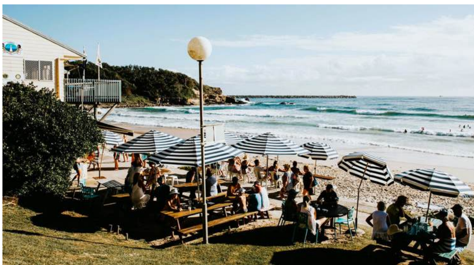
Residents would like to see cafes and shops in Catho

Overall, the 2025 survey results confirm what locals already know – that Catherine Hill Bay is a special place and its people are passionate about shaping its future while preserving its past. The Progress Association will use the survey feedback to guide its activities in influencing stakeholders and decision makers to achieve the best possible outcomes for our town.