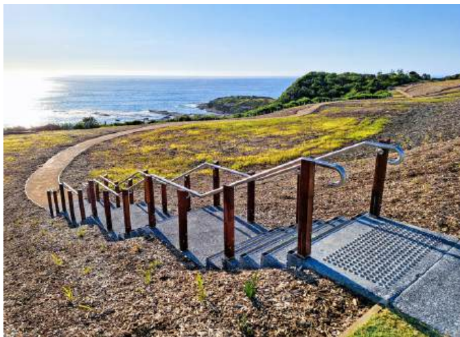
The survey revealed strong support for the coastal walkway from Middle Camp to Moonee Beach

A question raised by many in the survey responses was the relationship between the town's two active community organisations: the Progress Association and the Catherine Hill Bay Community Alliance. While they have different points of focus, both are dedicated to preserving and enhancing the town's unique character and improving the daily lives of residents. In recent times collaboration has strengthened between the two organisations, with joint efforts on environmental monitoring, event planning, and community advocacy. This is set to continue.