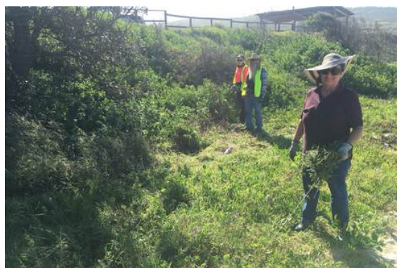
Restored Landcare sign (left), and the South Site team at work in Pat Slaven Reserve (above).