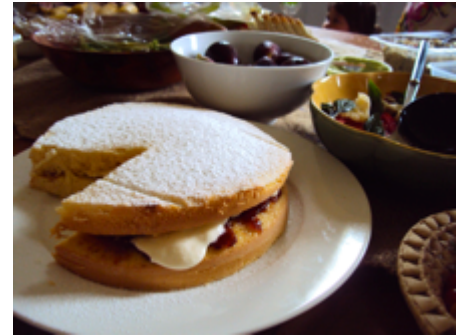
Jan 26 Australia Day Tennis, barbecue, bushtucker salad, Coronation chicken, a sponge cake and Pimms punch!